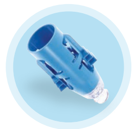
Spinning ChemoLock (CL20005)