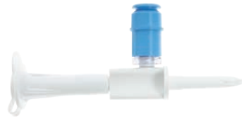
Bag Spike with ChemoLock Additive Port and Dry Spike (CL-12)

Dedicated lumen for direct access to solution bag