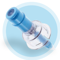
Genie Closed Vial Spike (CL-77)

The ChemoLock product line includes an assortment of bag spikes, vial adapters, and other components designed to meet the specific needs of your pharmacy, including: