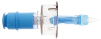
Genie Closed Vial Spike (CL-77)

Allows access to vials having 20 mm closures and automatically equalizes vial pressure with internal balloon