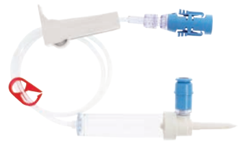
30" Secondary Set with Integrated ChemoLock Drip Chamber and Bonded Spinning ChemoLock (CL3511)