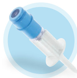
ChemoLock Bag Spike (CL-10)