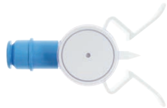
Locking Universal Vented Vial Access Device (CL-70)

Allows access to vials having 20 mm closures and automatically equalizes vial pressure with internal balloon